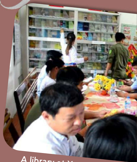
A library at Xuat Hoa CLC, Ho Chi Minh City