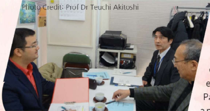
Staff interviews at Kominkan and Community Centre