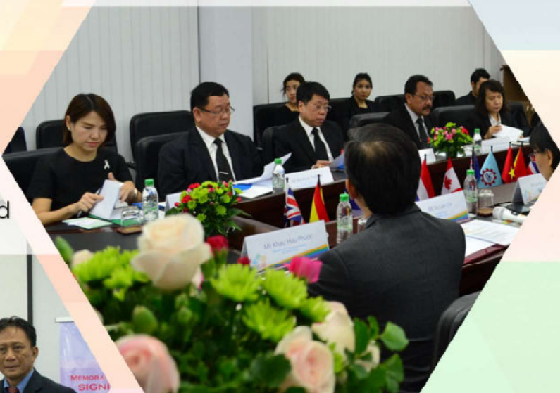
MOU Signing Ceremony between SEAMEO CELL and SEAMEO SEN